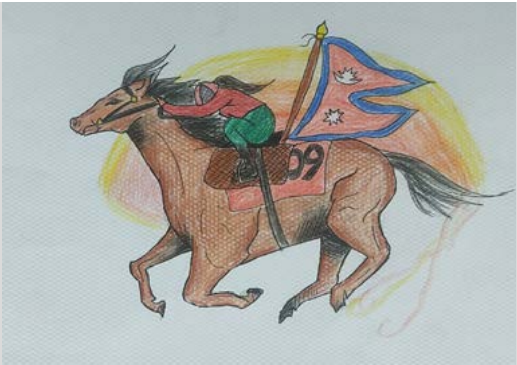
Ghode Jatra Nancy Khadka, 7-A4

Ghode Jatra is a traditional festival celebrated in the town of Bungmati and other parts of the Kathmandu Valley, usually in Chaitra (March or April). It honors the victory of the horse over evil spirits, with a grand procession featuring decorated horses, chariot races, and folk dances. The highlight of the festival is the thrilling horse race, where riders show their skills and bravery, attracting large crowds. It's a lively and vibrant celebration of cultural heritage and community spirit.