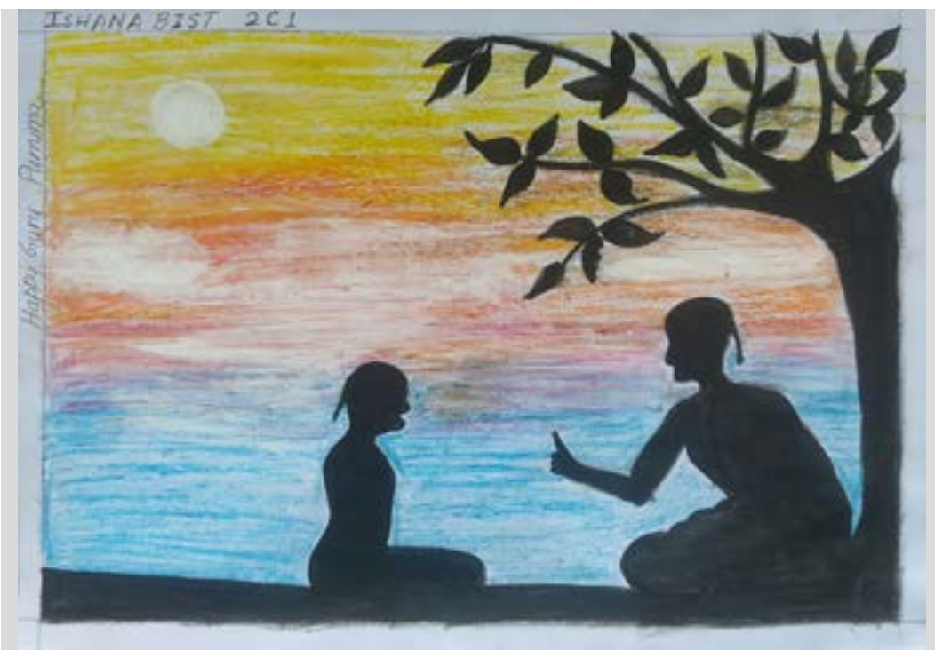
Guru Purnima Ishana Bist, 2-C1

Guru Purnima is a traditional Hindu and Buddhist festival in Nepal dedicated to honoring teachers and spiritual guides. Celebrated on the full moon day of Asar (June–July), students express gratitude to their gurus through offerings, blessings, and special ceremonies, acknowledging their role in imparting knowledge and wisdom.