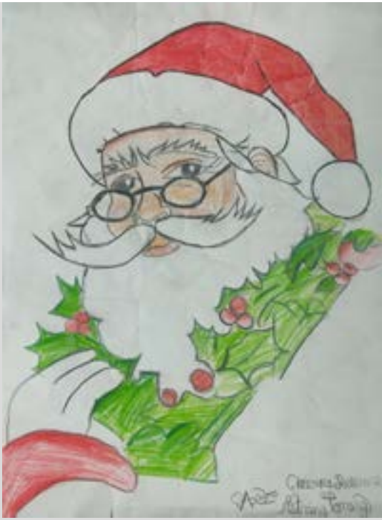
Christmas Astrina Tamang, 4-E1

Christmas, celebrated on Poush 10 (December 25), is observed in Nepal mainly by the Christian community but also embraced by others as a festive holiday. Marked with church services, carols, gift exchanges, and decorations, it spreads a message of peace, love, and joy. In cities, Christmas lights, trees, streets, houses are decorated with colorful lights and celebrations bring a cheerful and inclusive spirit.