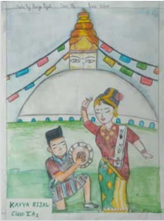
Tamu Lhosar Kavya Rimal, 5-D1

Christmas, celebrated on Poush 10 (December 25), is observed in Nepal mainly by the Christian community but also embraced by others as a festive holiday. Marked with church services, carols, gift exchanges, and decorations, it spreads a message of peace, love, and joy. In cities, Christmas lights, trees, streets, houses are decorated with colorful lights and celebrations bring a cheerful and inclusive spirit.