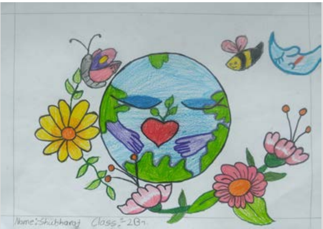
World Environment Day Shubhraj, 2-B1

Republic Day, or Ganatantra Diwas, is celebrated on Jestha 15 (June 29) in Nepal to mark the country’s transition to a federal democratic republic in 2008, ending centuries of monarchy. The day is observed with parades, speeches, and cultural events, honoring the values of democracy and national unity.