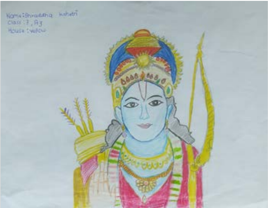
Ram Nawami Shraddha Kshetri, 7-A3

Ghode Jatra is a traditional festival celebrated in the town of Bungmati and other parts of the Kathmandu Valley, usually in Chaitra (March or April). It honors the victory of the horse over evil spirits, with a grand procession featuring decorated horses, chariot races, and folk dances. The highlight of the festival is the thrilling horse race, where riders show their skills and bravery, attracting large crowds. It's a lively and vibrant celebration of cultural heritage and community spirit.